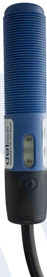
DOL 26 Capacitive Sensor